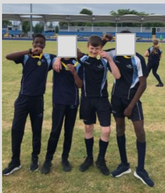
Y7 Relay team winners