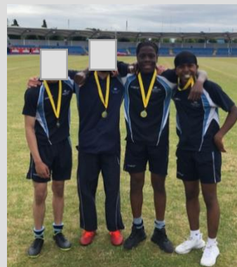
Y9 Relay team winners